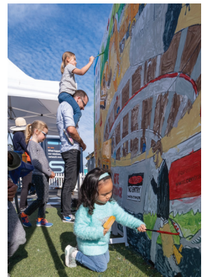
Visitors helped with our colourful mural