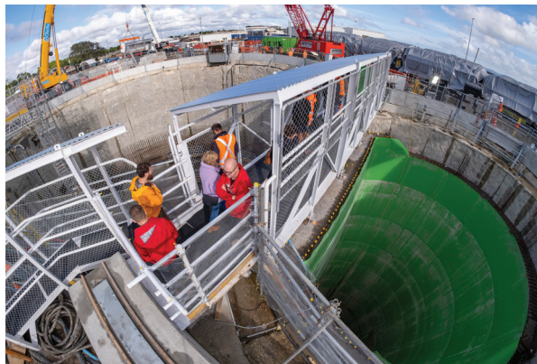
Visitors could view both shafts from the specially-built platform