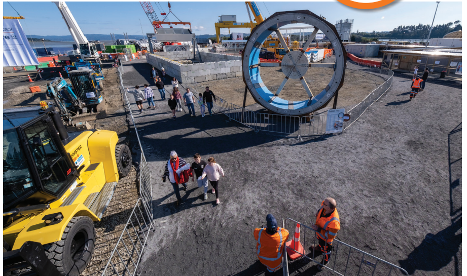
Alongside construction equipment we assembled a full-sized tunnel segment ring

It was great to see mana whenua, local elected members, industry leaders and the community come along to gain a better understanding of the work we have been doing and to see just how large this project is. Visitors were able to get up close to the equipment we're using on the project and view the 38m deep shaft from a specially built platform.