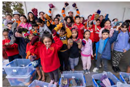
May Road School pupils with their Make Give Live slippers

To provide warmer head gear for its workforce, our contractor bought 200 beanies. As part of the ‘Give’ part of the programme, it then provided our neighbours, May Road School, with 200 distinctive, bright pairs of slippers. We are so pleased to be able to help the children’s learning by keeping them warm in the classroom.