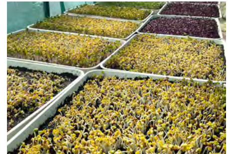
Micro-greens will add colour to local dishes

They focus on sustainability and using organic horticulture techniques and are now delivering fresh produce to restaurants in the local area.