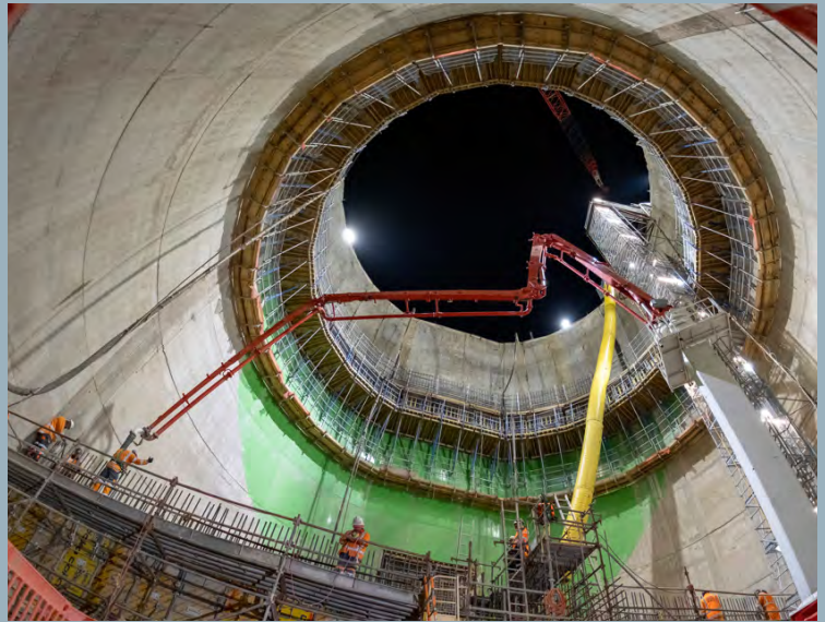
Pouring concrete inside the Māngere main shaft

We have 17 construction sites along the route (see the map). Large construction sites will operate for four to six years, with smaller sites open for around 24-30 months. At these sites we are digging the shafts we need to insert and remove equipment and materials. Most of the shafts will also connect to existing underground pipes, collecting their wastewater and transporting it to the Māngere Wastewater Treatment Plant.