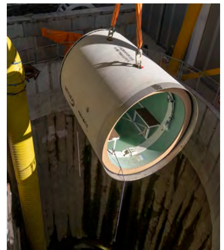
Domenica being lowered into our May Road shaft