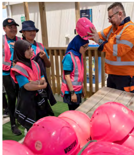
School pupil visitors don pink hard hats for Breast Cancer