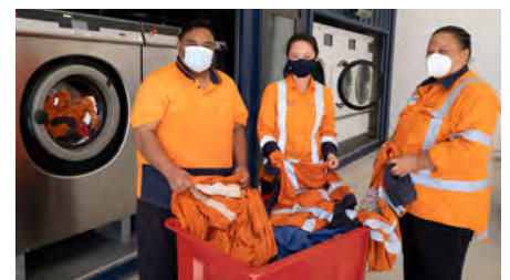
Laundry staff busy with another big load

We hope the work experience will help some of the younger Marae generation who are not currently in employment.