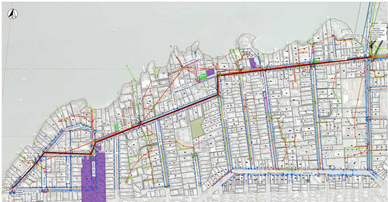
Figure 1: Proposed alignment of the Herne Bay Trunk Sewer

The following section provides details on the proposed construction method of the Herne Bay Trunk Sewer Line. It is broken down to work elements that are repeated along the alignment. The pipeline is constructed via a series of shafts from which a Tunnel boring machine (TBM) is launched (Thrust Shafts) and retrieved (Receiving shafts) as the TBM progresses along the alignment sections of pipe are placed in the thrust shaft and then jacked in behind the TBM as it progresses.