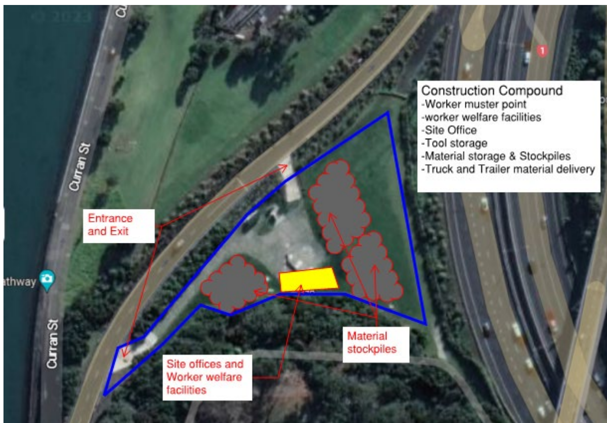
Figure 4: CSA-2 at 94a – b Shelley Beach Road Establishment

The CSAs will be established with fixed hoardings and fencing to secure the site. Topsoil will be removed and replaced with hardfill, compacted to provide a secure, trafficable compound. Site offices will be set up with the intention of permanent local water, sewer and power