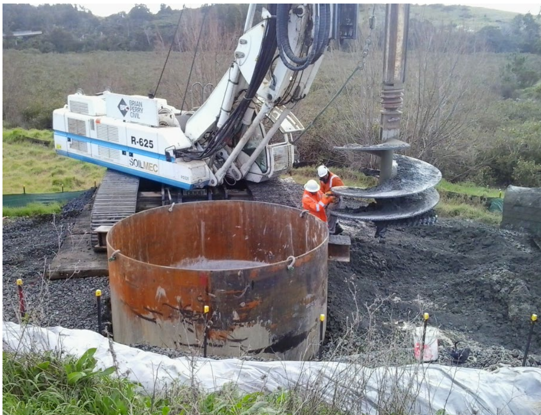
Figure 8 Interception shaft Casing installation

On completion of the main drives the interception shafts will be installed. The drill rig will be remobilised to site and commence drilling the shaft, as it progresses, a 3.5m diam steel casing will be installed. This temporary casing is for securing the shaft while creating a connection to the main pipeline and constructing a manhole. On completion of the manhole the casing will be recovered, and the shaft annulus backfilled.