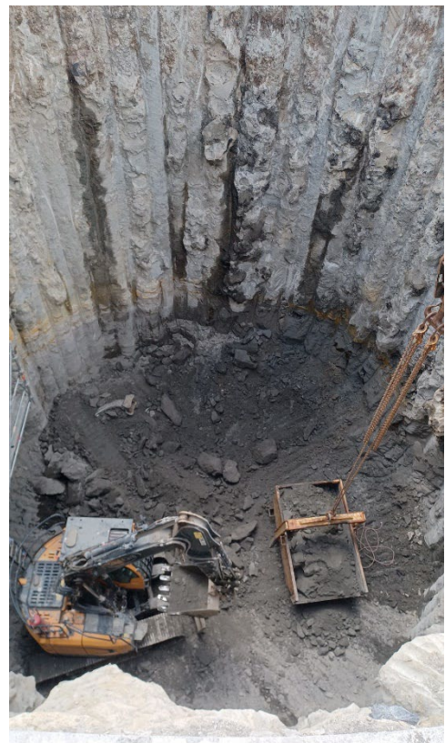
Figure 6 Typical Secant Pile shaft under Excavation

Tunnelling will be carried out using a tunnel boring machine (TBM), this will be lowered into the shaft built up to then bore along the tunnel alignment. As it progresses pipe sections will be loaded onto the jacking bed and utilised to transfer the thrust load to the TBM. The closed face TBM will excavate the soil and remove from the tunnel via a Slurry or EPB TBM option. With a slurry method the cuttings will be transferred by pumping to a separation plant on the surface or with