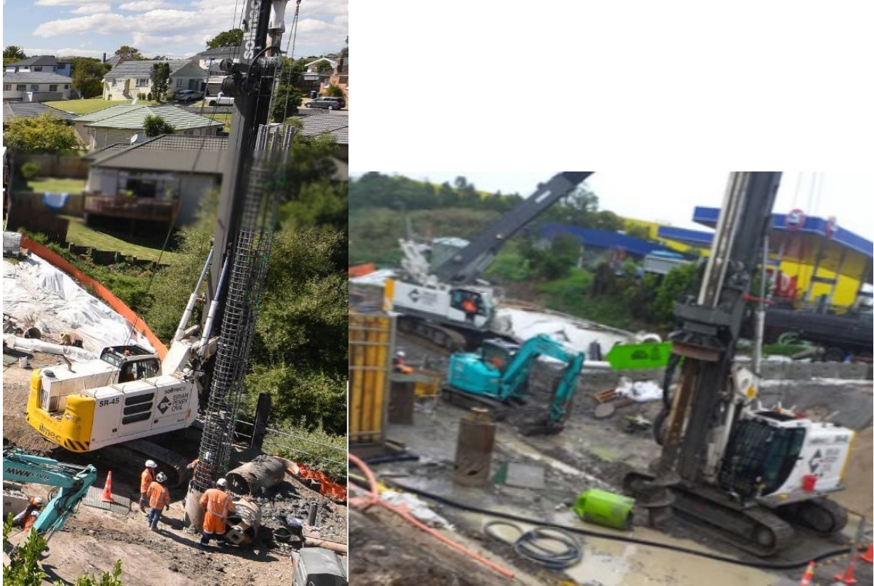
Figure 7 Typical Secant Pile construction

Piling will be undertaken with the secant pile shaft being constructed with a bored pile rig and crane. Steel casings and tooling will be stored on site and reused while pile cages will be stored and prepared at CSA-2 to be brought to the site as and when ready to be lifted direct from the truck and into the pile bore. These will then be concreted, with the CSA being used as a marshalling yard for where there is no capacity onsite for waiting concrete trucks.