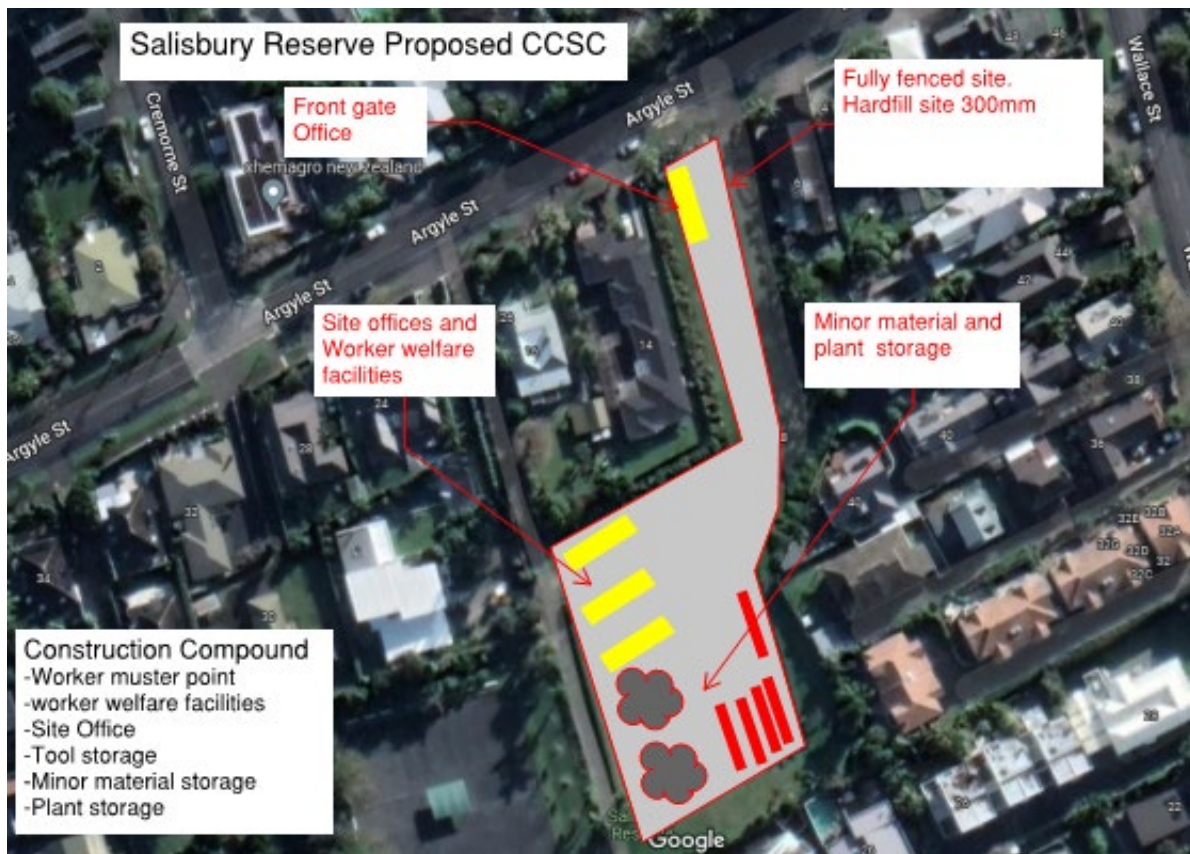
Figure 3: CSA-1 at Salisbury Reserve