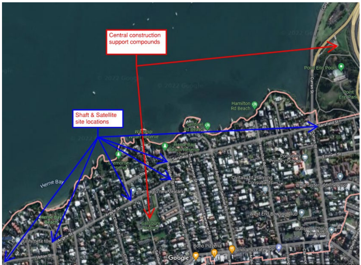
Figure 2: Locality map of proposed CSAs and satellite sites