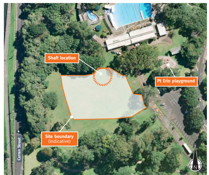
Point Erin Park construction site layout

The work at the top of the park is the sole construction site for the Central Interceptor project. There has been a lot of recent discussion about other wastewater works in the area, such as in the southwest corner of the park. These potential future works are still being planned and when more information is available, Watercare will be in touch with those details.