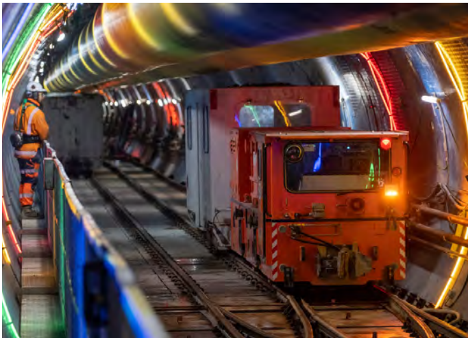
An electric locomotive delivers tunnel segments to and removes spoil from the TBM

With another TBM, CI has also just completed boring two smaller (2m+-wide) sewers, totalling 4.3km. These will connect west Auckland networks to the main tunnel. Adding Point Erin, the project has 17 construction sites, all with deep shafts to help connect existing wastewater infrastructure to the CI tunnel.